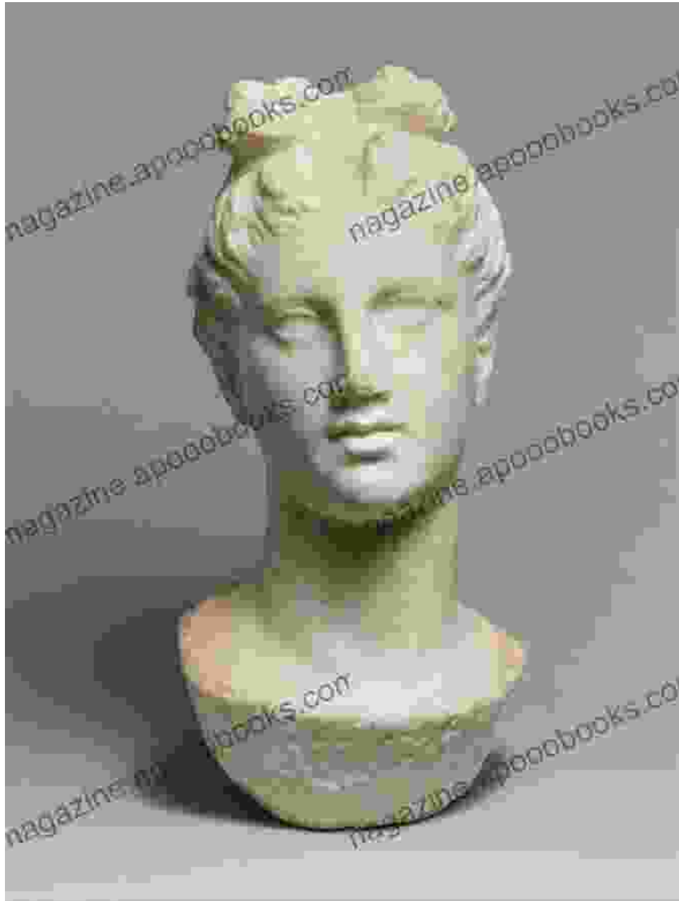
Marble Sculpture by The Sculptress Alexander

Nature and the human form serve as the primary sources of inspiration for The Sculptress Alexander. Her sculptures often depict the female figure in various states of motion or repose, capturing the fluidity, grace, and vulnerability of the human body.