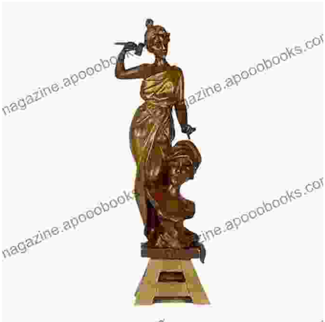
Bronze Sculpture by The Sculptress Alexander

The Sculptress Alexander is not only known for her artistic vision but also for her exceptional technical skills. She employs a wide range of sculpting techniques to achieve the desired forms and textures in her works.