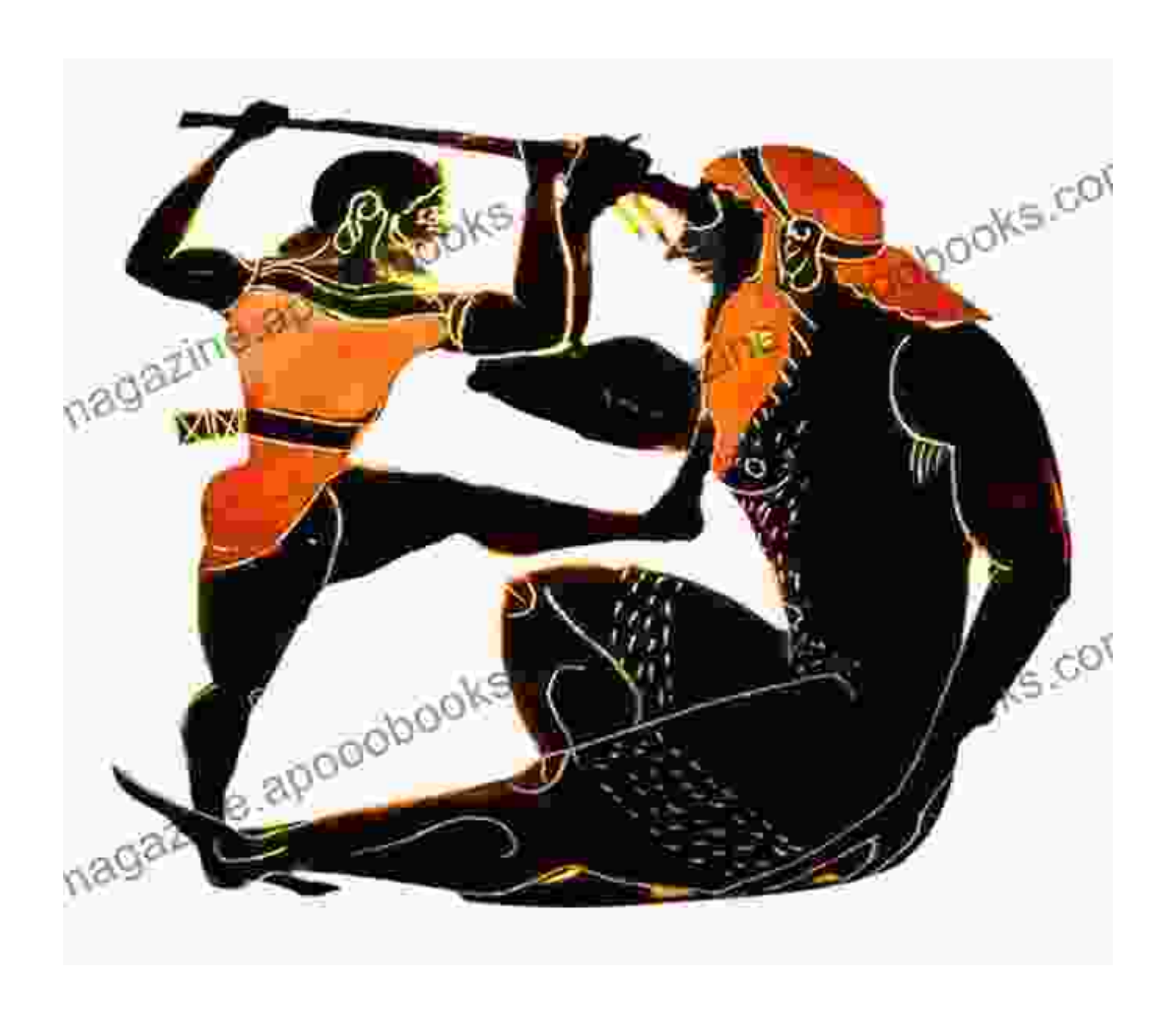
Illustration of Odysseus facing the Cyclops Polyphemus in the Odyssey

The Odyssey is more than just a tale of adventure; it is a profound allegory of life's journey. Through Odysseus's trials and tribulations, Homer explores the themes of identity, belonging, and the challenges we encounter in our quest for fulfillment.