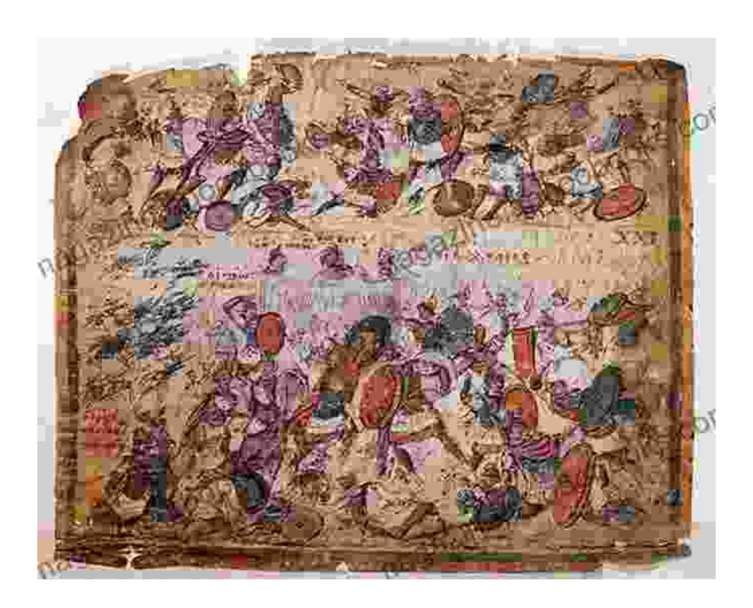
Illustration depicting a fierce battle scene from the Iliad

At the heart of the Iliad lies the conflict between the mighty warrior Achilles and the commander-in-chief Agamemnon. Achilles' wrath - stemming from a dispute over a captive woman - and its devastating repercussions become the central theme of the poem.