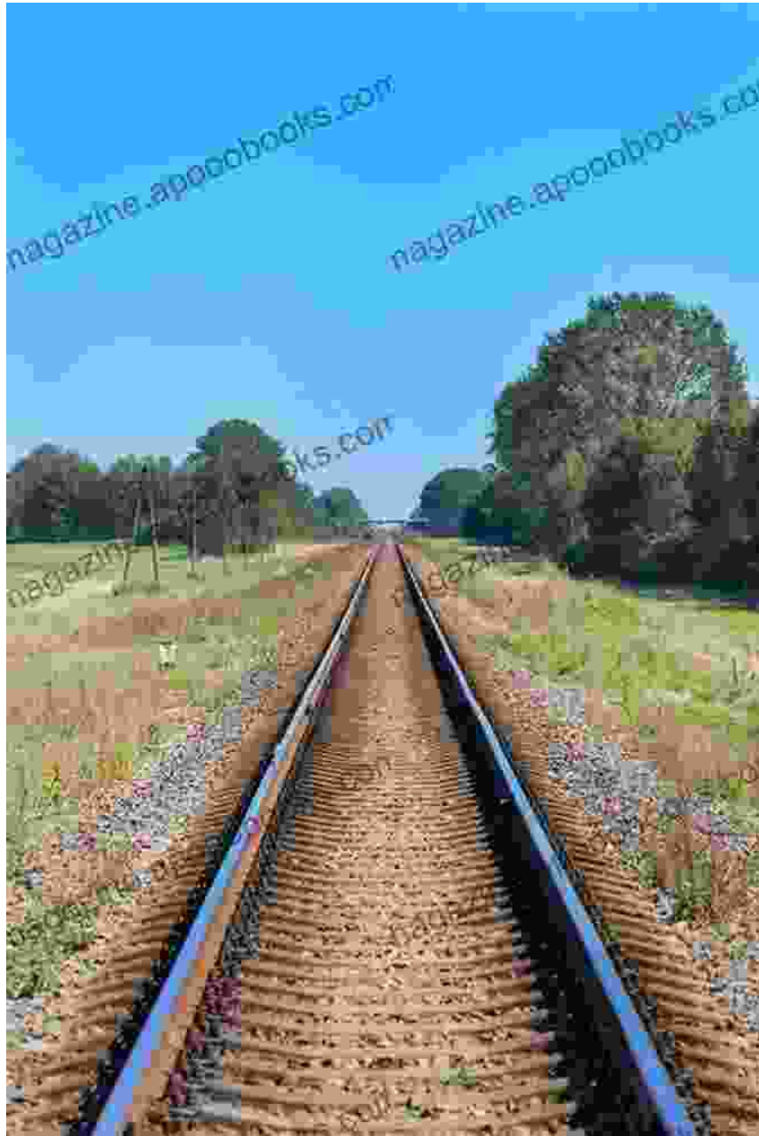
Railroad Noir: The American West at the End of the Twentieth Century (Railroads Past and Present)