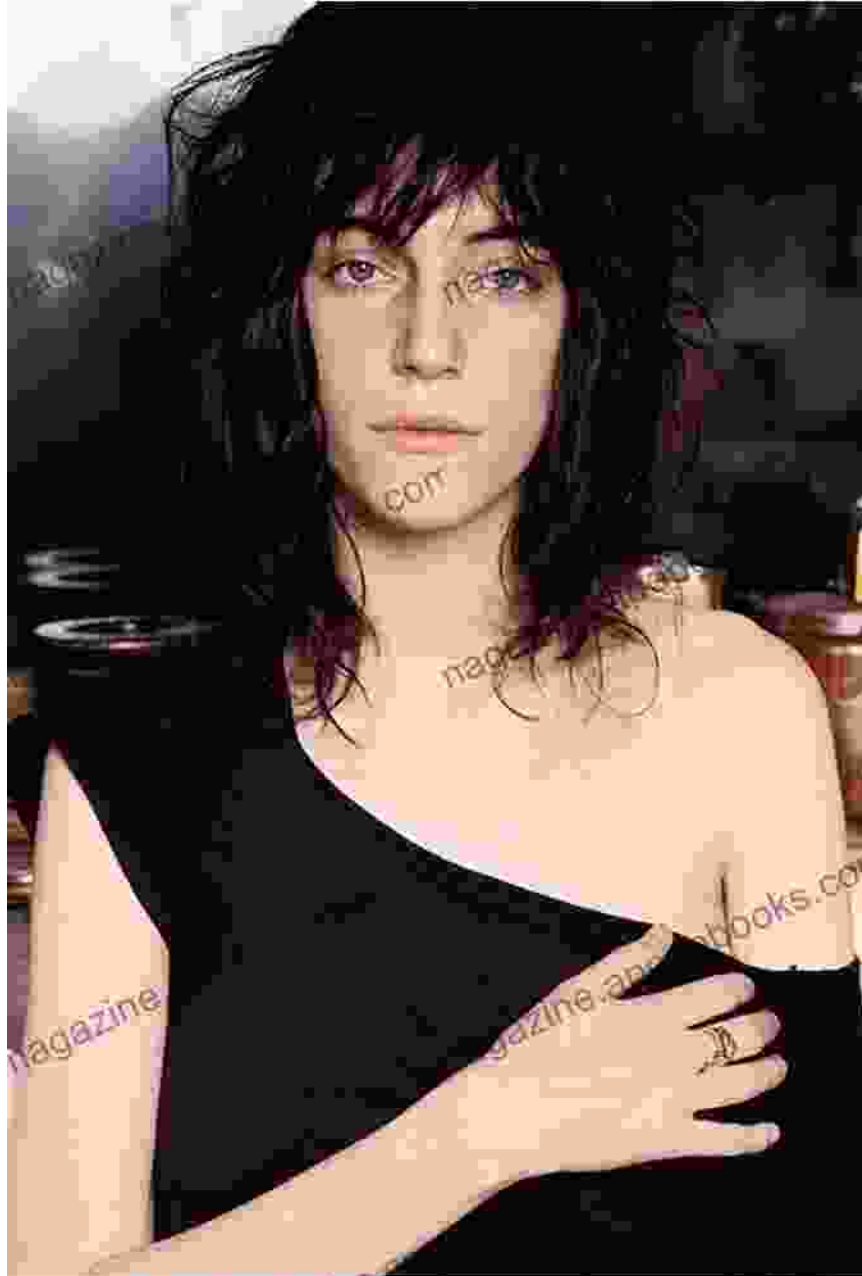
A candid portrait of Patti Smith