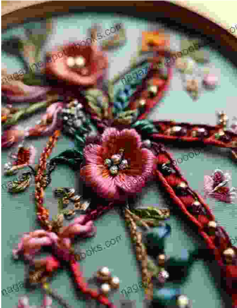
Image caption: The meticulous attention to detail in this cross-stitch project demonstrates the patience and skill required.